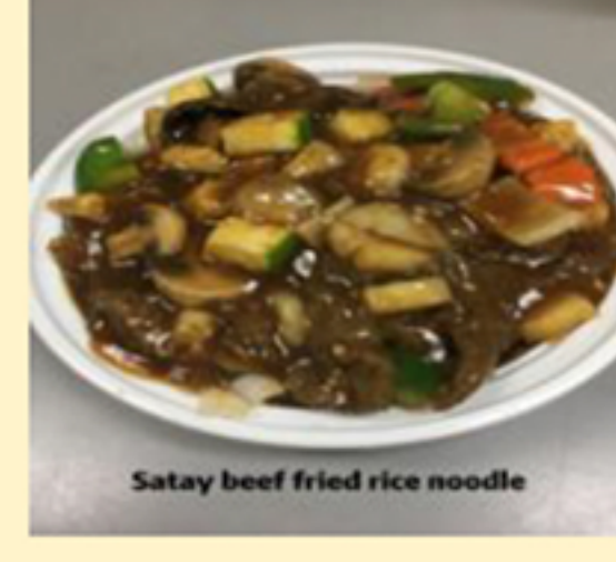
Beef Fried Rice Noodle P1